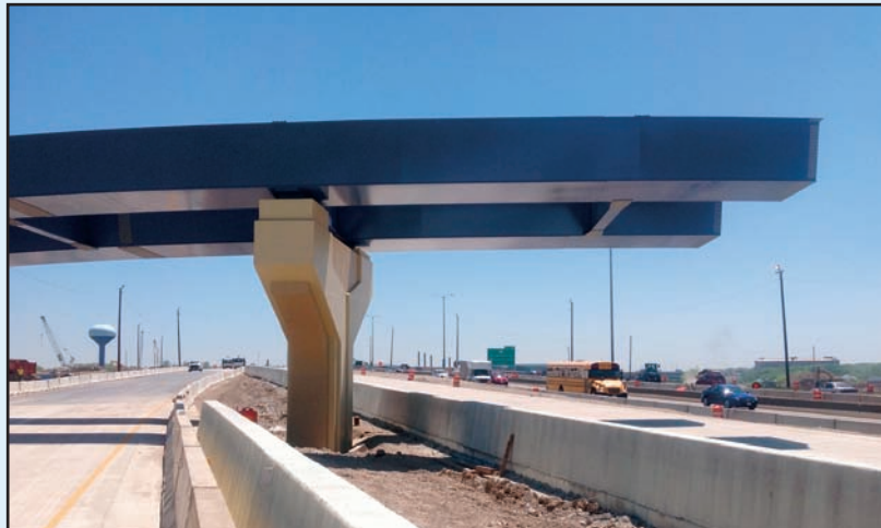
Work is on-going over and around the highway.