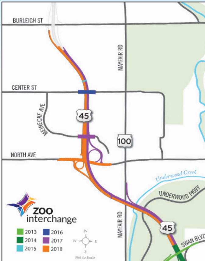
Depending on funding, projects will continue through 2018.