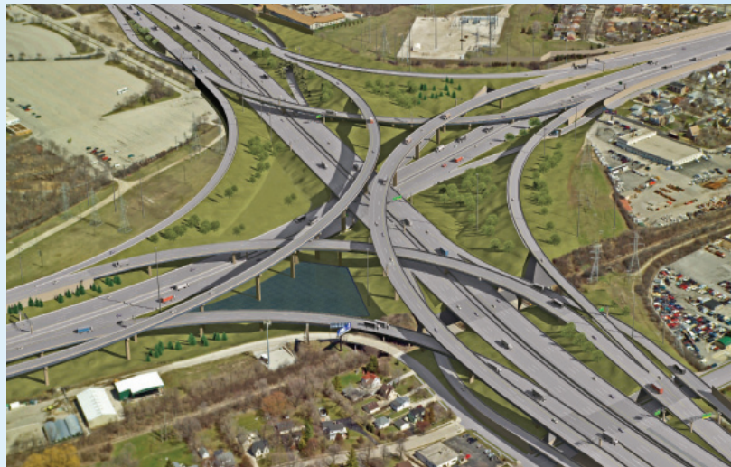
The core of the Zoo Interchange is the connection of I-894, I-94 and US 45. It is the busiest interchange in the state of Wisconsin and the construction will involve 38 bridges and 43 retaining walls.