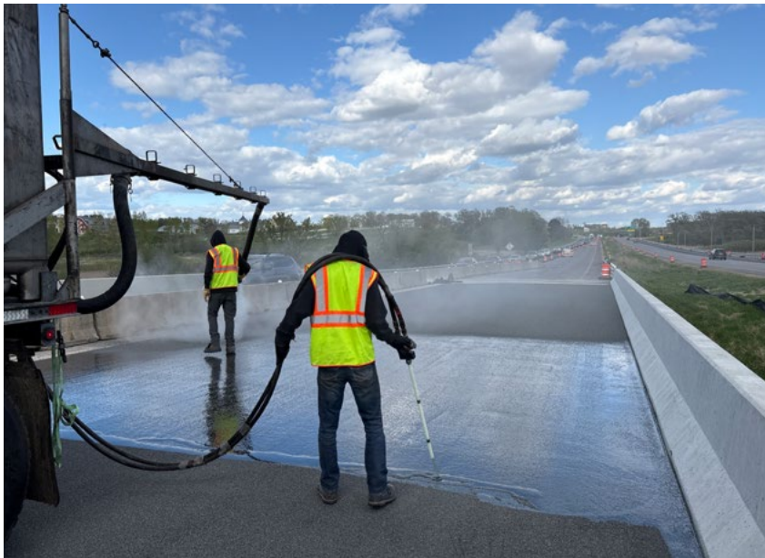
Above: Polymer Overlay on the Sugar River Bridge Deck