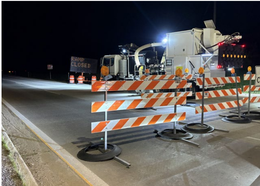
Above: Nighttime Pavement Marking