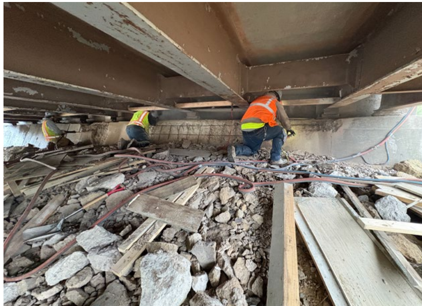
Above: Concrete surface repair on westbound bridge abutment