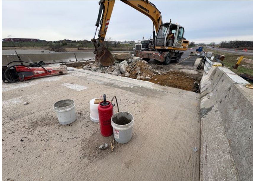
Above: Concrete pavement approach slab removal on westbound bridge