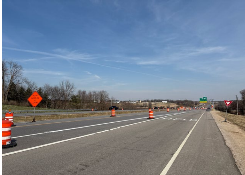
Above: Traffic control at County G eastbound on-ramp