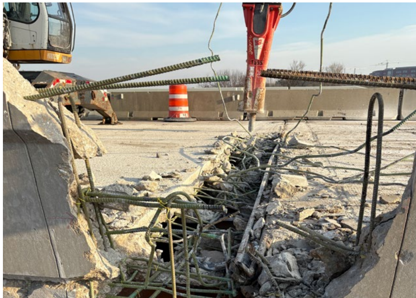
Above: Expansion joint replacement at westbound Sugar River bridge