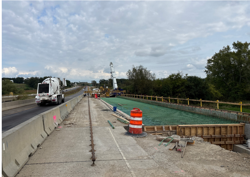
Above: Deck widening of the Sugar River bridge along US 18/151 eastbound