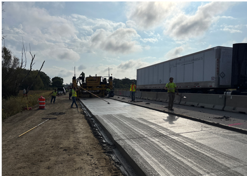
Above: Westbound US 18/151 concrete base paving.jpg

The project team thanks you for your patience and cooperation throughout this project!