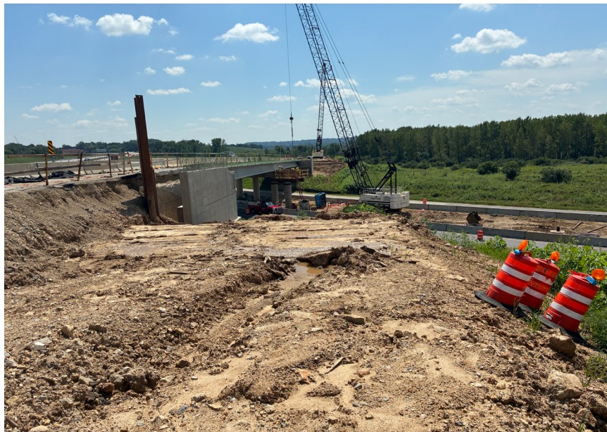
Above: Bridge widening pier construction along eastbound US 18 on-ramp

The project team thanks you for your patience and cooperation throughout this project!