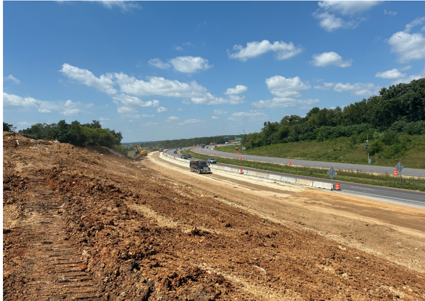
Above: Auxiliary lane grading along eastbound US 18 between W. Verona Avenue and WIS 69