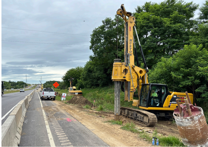
Above: Crews drilling 36" diameter and 16' deep sign structure foundations