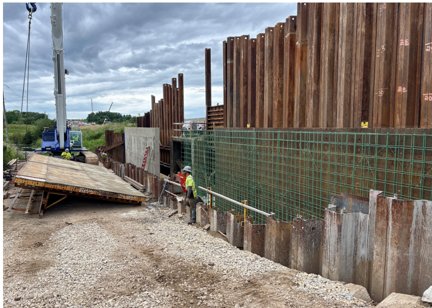
Above: Military Ridge Trail box culvert extension - wing wall construction (south side)

The project team thanks you for your patience and cooperation throughout this project!