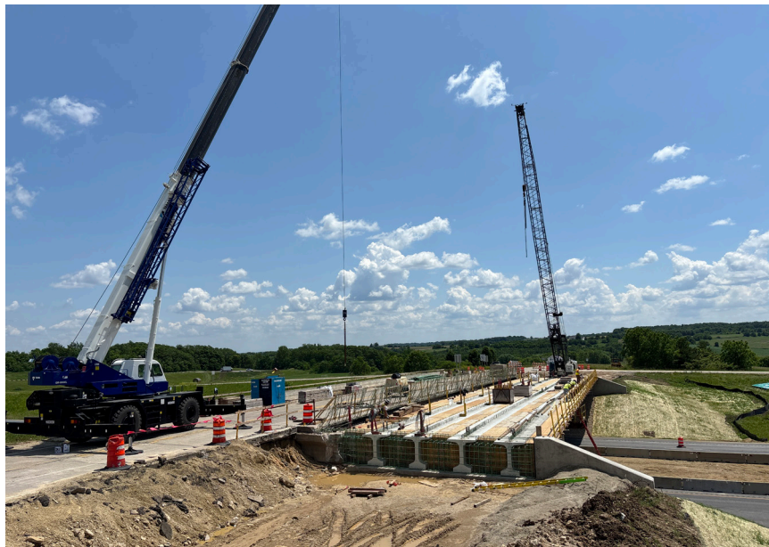
Above: County G deck forming, with rebar installation and concrete deck pour to follow

The project team thanks you for your patience and cooperation throughout this project!