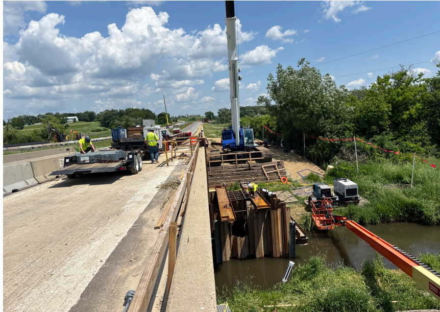
Above: Cofferdam complete, pile driving to begin at the east pier for the eastbound Sugar River Bridge widening