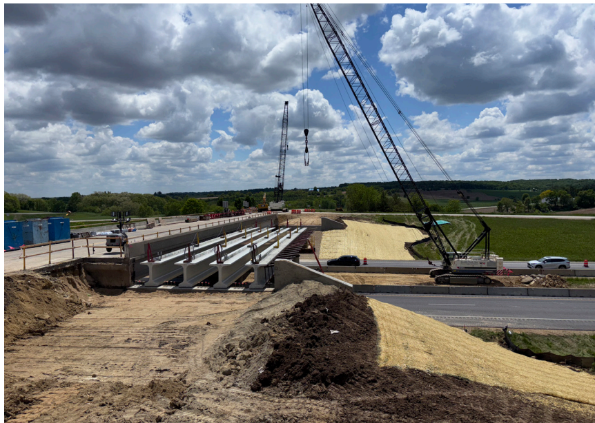
Above: Prestressed concrete girders set in place at County G bridge

The project team thanks you for your patience and cooperation throughout this project!