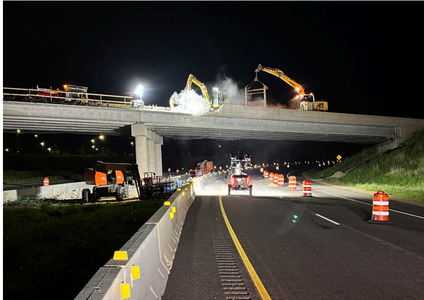
Above: Bridge deck removals at W. Verona Ave entrance ramp to eastbound US 18-151