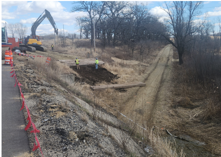
Above: Access road construction for Military Ridge Trail culvert extension