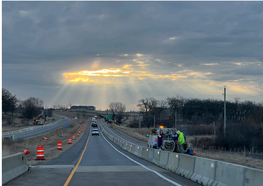
Above: Lane closures in place along US 18/151 facing east