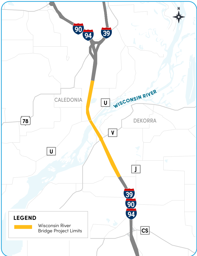
Above: Project Limits

During construction, I-39/90/94 will remain open to three lanes in each direction during peak travel times. Occasional traffic impacts along County V, St. Lawrence Bluff Road, and Oak Knoll Drive.