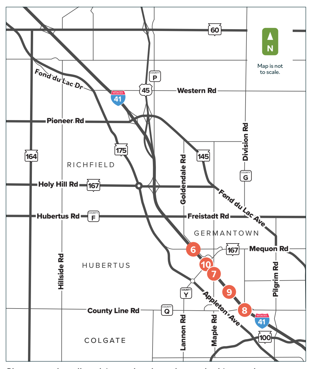
Please note that all work is weather dependent and subject to change.

The project team thanks you for your patience and cooperation during these projects!