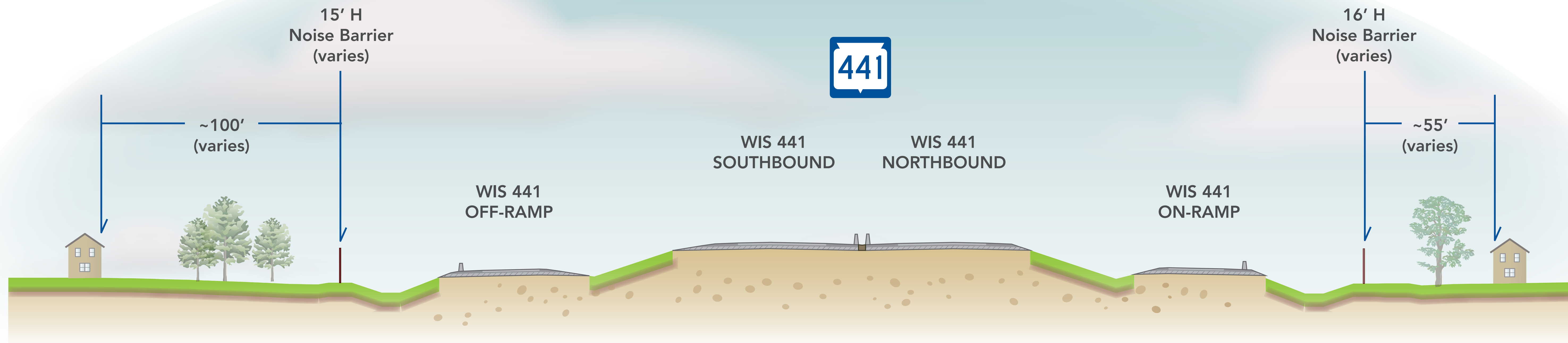
▲ Typical section (facing east)