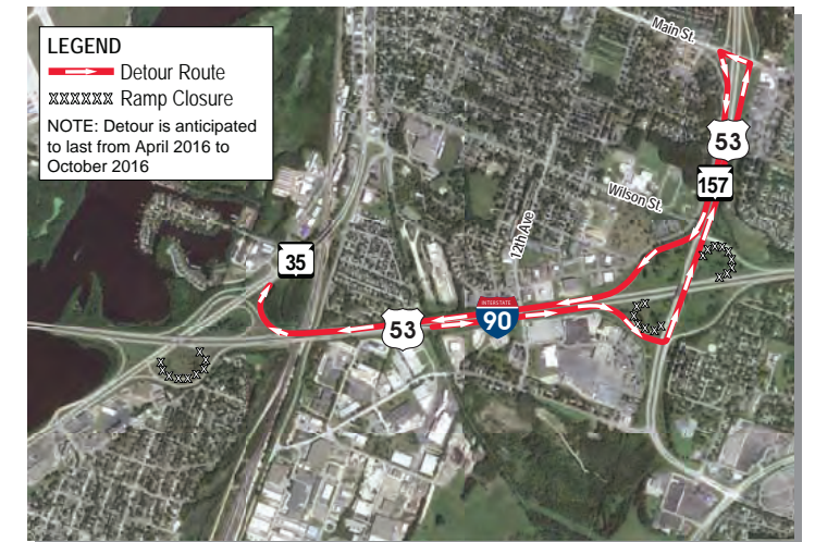
Detour: I-90 eastbound to WIS 35 northbound