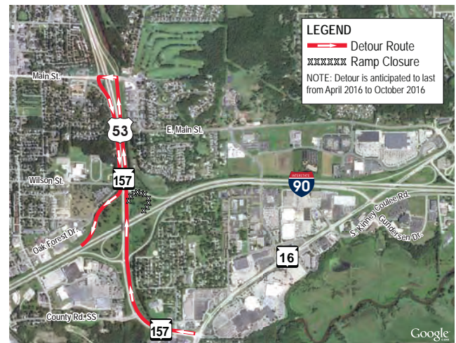
Figure A: Northbound WIS 157 to Westbound I-90