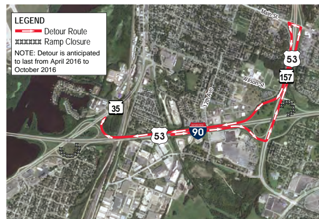
Figure C: I-90 eastbound to WIS 35 northbound