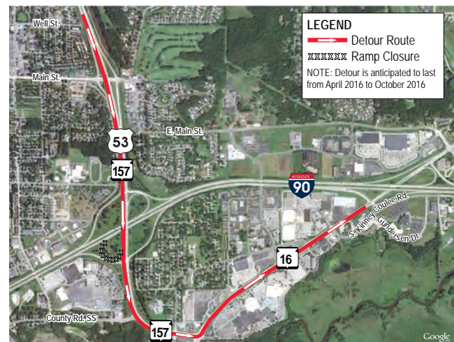
Figure B: Southbound WIS 157 to Eastbound I-90