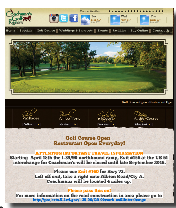
Notice of road construction on Coachman's Golf Resort website.