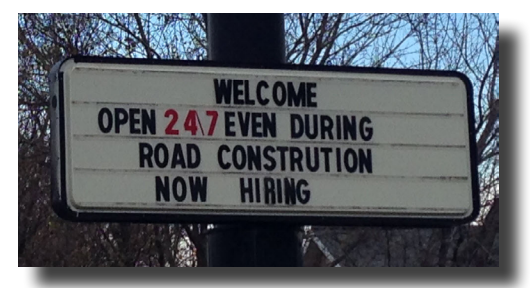
Businesses near the I-39/90 and WIS 59 interchange let customers know they were open during construciton.