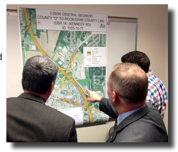
I-39/90 Project open house meeting.