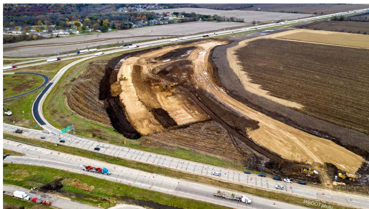
Just before the 2018 construction season finished last November, grading work took place on the northeast quadrant of the I-39/90 and I-43 interchange (Exit 185 A-B) near Beloit. This photo shows future I-43 southbound lanes to the I-39/90 northbound ramp.

Travelers in the Beloit area will notice work has resumed on Phase 1 of the reconstruction of I-39/90 and I-43 in Beloit. In mid-March, I-43 traffic shifted to the southbound side and was reduced to one lane in each direction so crews can reconstruct the lanes on the northbound side. Work also includes updating the interchange ramps and modifying the roundabouts' truck aprons at the County X/Hart Road interchange.