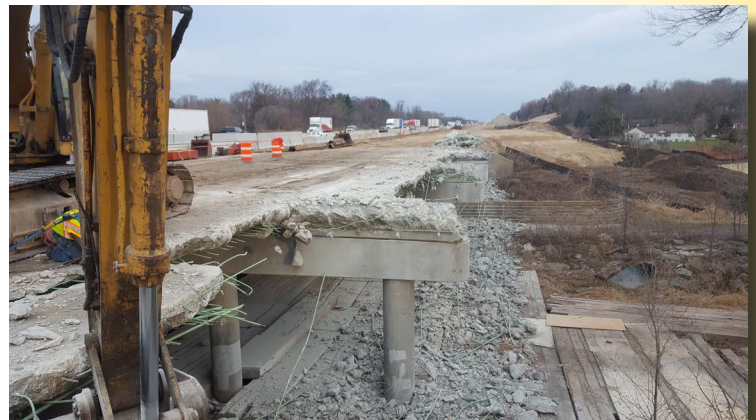
In early December, demolition began on the I-39/90 northbound bridge over the Spring Brook Trail. Similar reconstruction activities will take place on the bridges listed to the left.

The closures are expected to only last a few days and advance notice will be sent through area media, the project website , project Facebook page , and the project email distribution list . In addition, a portion of the Ice Age National Scenic Trail Bridge will stay closed until spring 2018. A detour route is in place for bicyclists and pedestrians.