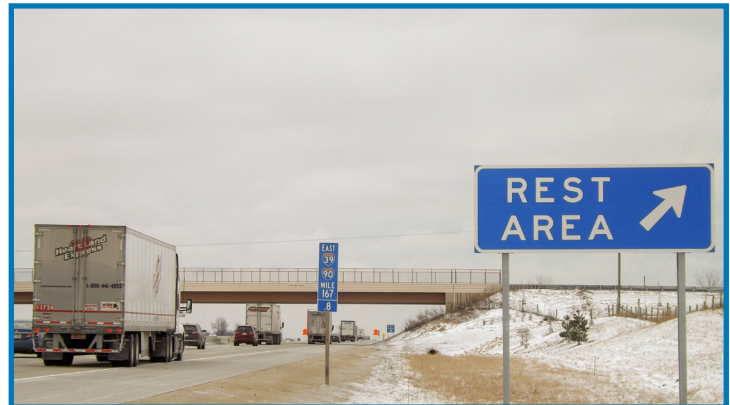
(Left) Miles of grading operations occurred in 2016-2018 along the new lanes of I-39/90. (Center) In fall 2019, three lanes opened in each direction for about 20 miles of the 45-mile project, between the Rock River Bridges in Edgerton to County AB, south of Madison. (Right) The expansion of Rest Area 17, along I-39/90 just north of Janesville, was completed in fall 2019, adding 28 new semi stalls.