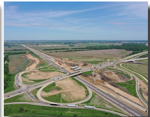
Aerial photos of the I-39/90 and I-43/WIS 81 interchange (Exit 185) in Beloit.