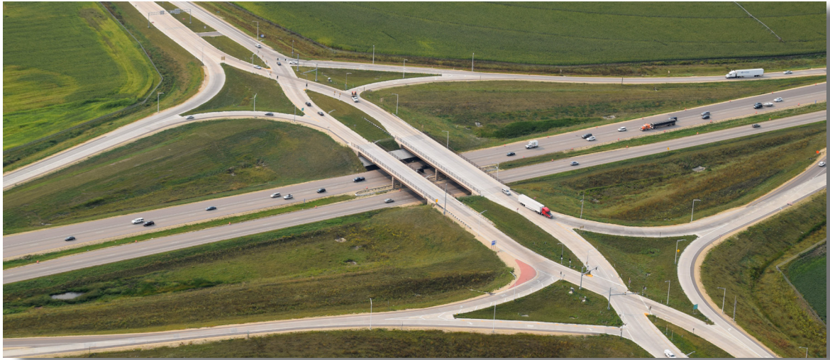
Wisconsin's first Diverging Diamond Interchange (DDI) was complete in November 2016 at the I-39/90 and WIS 11 (Avalon Road) interchange (Exit 177) south of Janesville.

A lot has been accomplished since expansion of the 45-mile section of I-39/90, between Beloit and Madison, began in 2015. In preparation for Interstate reconstruction, improvements were made to county and state highways including County G, US 14, US 51, WIS 73 and the US 12/18 intersection near Deerfield. These roadways were designated as alternate routes in the event traffic needed to be redirected off I-39/90 as part of incident management.