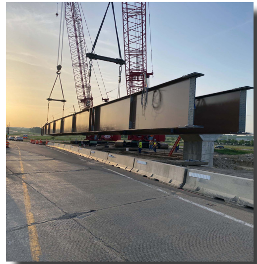
Bridge girders were placed on I-43 northbound in Beloit in June. Each girder weighs up to 115,000 pounds!

In addition to the piers, some of the steel girders have been set for the new I-39/90 southbound flyover ramp to I-43 northbound. Cranes are used to lift each girder into place. When complete in August, the highest point of any of the flyover ramps will be the I-43 southbound to I-39/90 southbound ramp which will carry motorists about 30-40 feet above the traffic lanes below.