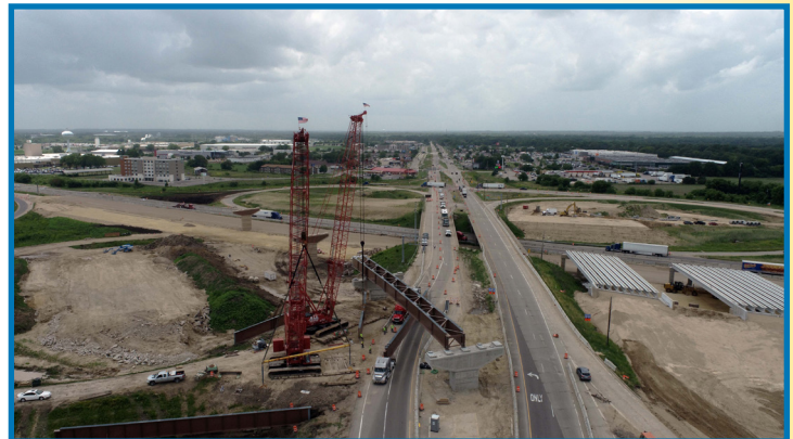
(Left) Newville Road under I-39/90 in Janesville underwent reconstruction in June, and is now open, including the I-39/90 bridge over Newville Road. Local roadways under I-39/90 between Janesville and Edgerton are open. (Center) Crews in Janesville are performing median work this summer and will begin reconstruction of I-39/90 southbound this fall. (Right) Construction of the new flyover ramps between I-39/90 and I-43 are going up in Beloit; learn more on page 4 .