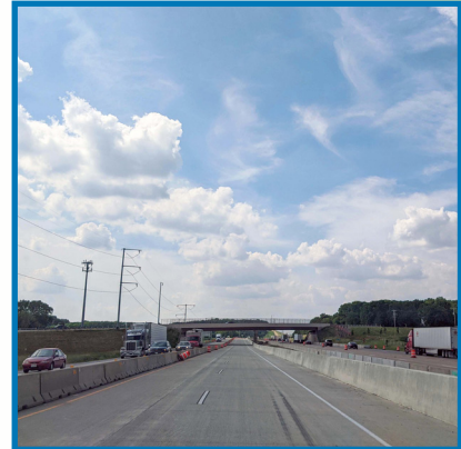
(Left) Construction continues this summer on the new I-39/90 northbound bridge over the northbound Interstate ramp to westbound US 12/18 (Beltline) in Madison. (Center) Crews placed the first area of select crushed aggregate for the new subgrade as part of the I-39/90 and US 12/18 (Beltline) interchange (Exit 142 A-B) reconfiguration in Madison. (Right) Crews continue reconstruction and expansion of I-39/90 northbound between County AB and the US 12/18 (Beltline) interchange near Madison.