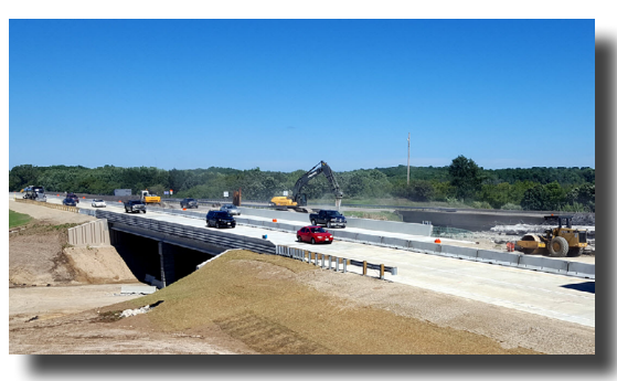
Southbound Interstate traffic travels on new bridge at the US 51 interchange (Exit 156).