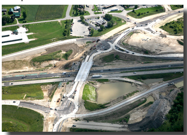
The three roundabouts begin to take shape, as work progresses on the I-39/90 and WIS 59 interchange in northern Rock County.

Construction at the I-39/90 and WIS 59 interchange is currently anticipated to be completed and fully open to traffic in mid-November. Final restoration, bridge staining and landscaping may occur in spring 2017 with minimal traffic impacts.