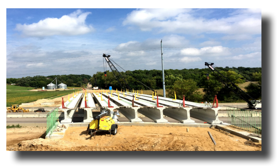
The County BN bridge over I-39/90 is removed and lengthened to accommodate future Interstate lanes.

Register for I-39/90 project email updates at <a href="www.i39-90.wi.gov">www.i39-90.wi.gov</a> to learn about the remaining work for these projects and when they will be completed. Final restoration and landscaping remains for most of these projects, and may be completed in spring 2017 with minimal traffic impacts.