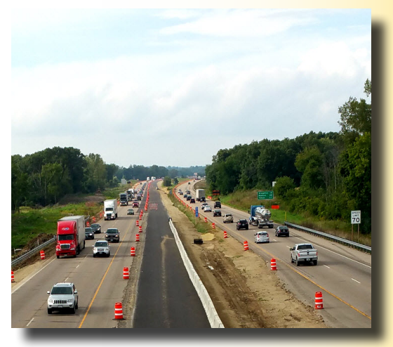
Temporary widening occurred on I-39/90 southbound near Edgerton this year. All Interstate traffic will be shifted onto this side next year during the I-39/90 northbound expansion in this area.