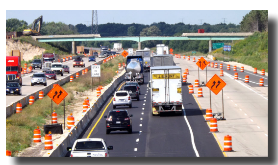
Motorists use temporary widening on I-39/90, north of WIS 59, as crews reconstruct the new northbound Interstate lanes in this area.