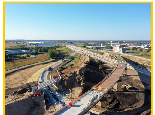
The final bridge beams on the entire I-39/90 Expansion Project were set in mid-September for the new I-39/90 northbound flyover ramp to I-43 northbound in Beloit. The I-39/90 and I-43/WIS 81 interchange will open by early December.