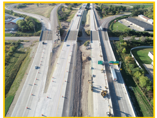
The new I-39/90 northbound lanes and alignment at the I-39/90 and US 12/18 (Beltline) interchange are open! Madison area work will conclude in mid-November.

In these final months of I-39/90 construction, please obey the reduced speed limit of 60 mph in work zones, eliminate distractions and leave room to brake. Every driver makes a difference!