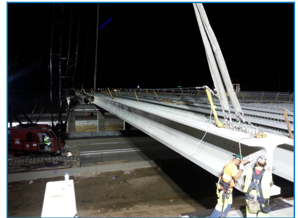
Bridge girders being placed at the I-39/90 and WIS 73/US 51 interchange, near Edgerton.