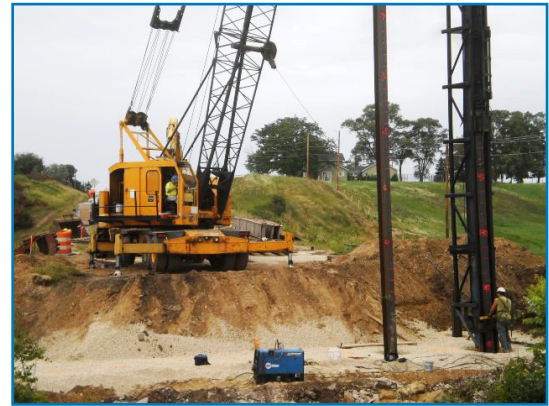
Work underway for new bridge on County G, north of Sunny Lane.